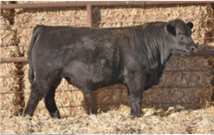
LOT 41 ASH VALLEY BOTTOMLINE 2018