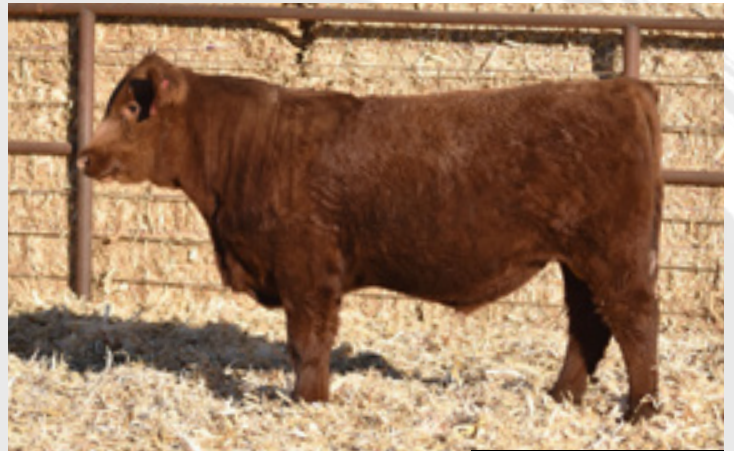
LOT 50 ASH VALLEY EVOLUTION 2110